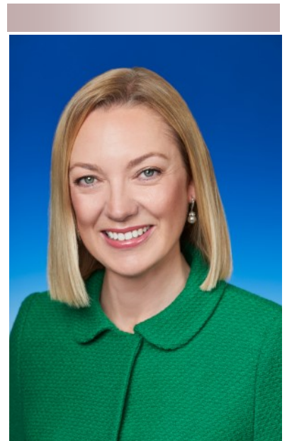
Mia Davies