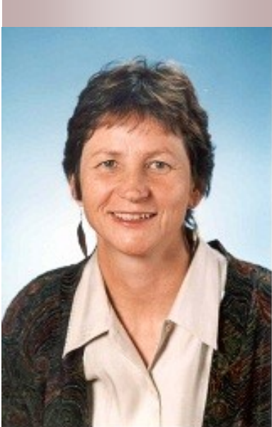
Dee Margetts