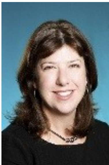
Adele Carles

When Dr Elizabeth Constable (Ind) won the by-election for Floreat on 20 July 1991 she became the first female to be elected without party endorsement to the Parliament of Western Australia. Constable did not contest the state general election on 9 March 2013. Before her retirement she was the longest serving woman MP in Western Australia.