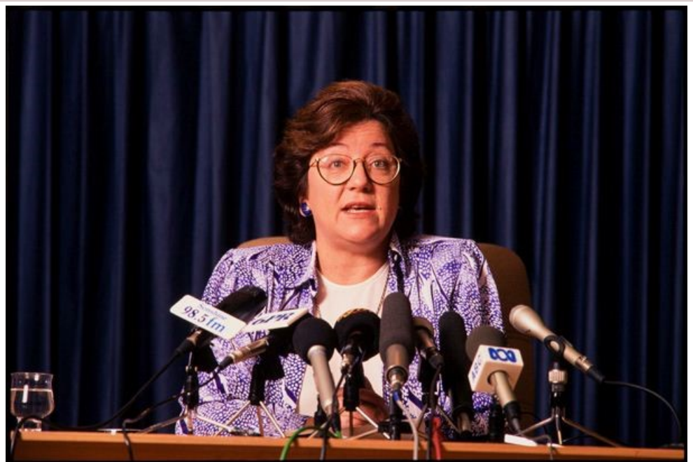
Dr Carmen Lawrence, first woman Premier of Western Australia

Dr Lawrence (Subiaco), Inaugural speech, Hansard, 10 June 1986