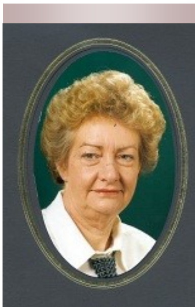
Kay Hallahan

Kay Hallahan (ALP) was the first female Member of the Parliament of Western Australia to serve in both the Legislative Assembly and the Legislative Council. She was first elected to the Western Australian Legislative Council for a term commencing 22 May 1983, representing the South East Metropolitan Region. She was later elected to the Western Australian Legislative Assembly representing the Armadale electorate.