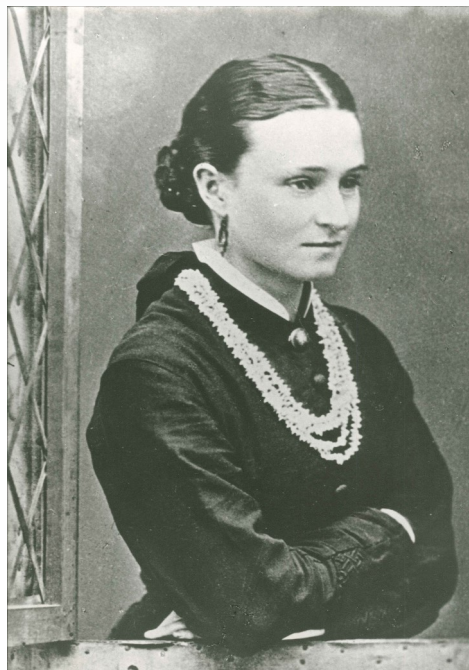
Edith Cowan, c.1880s